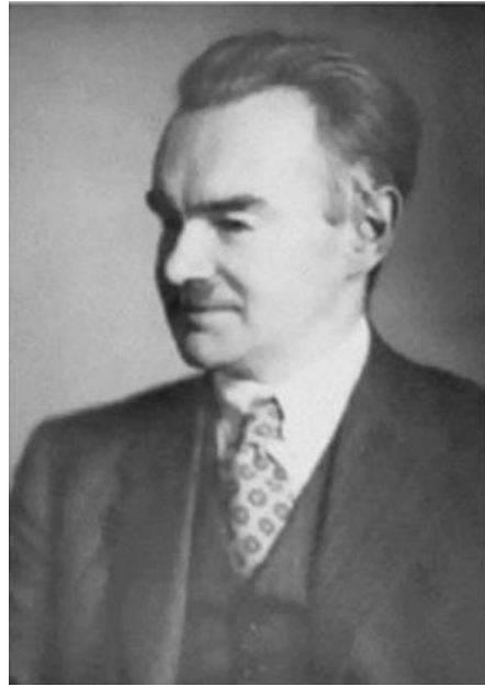
William Oglivy Kermack April 26, 1898 – July 20, 1970